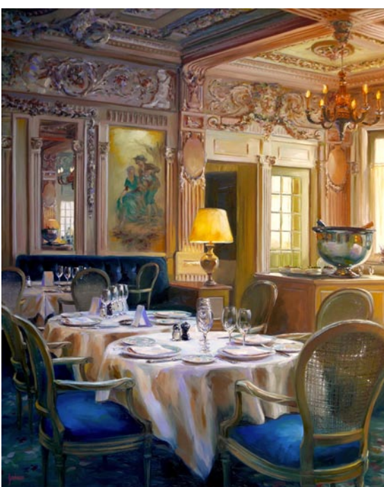
Glittering Tables of La Victoria, Paris o/c 30"x 24"