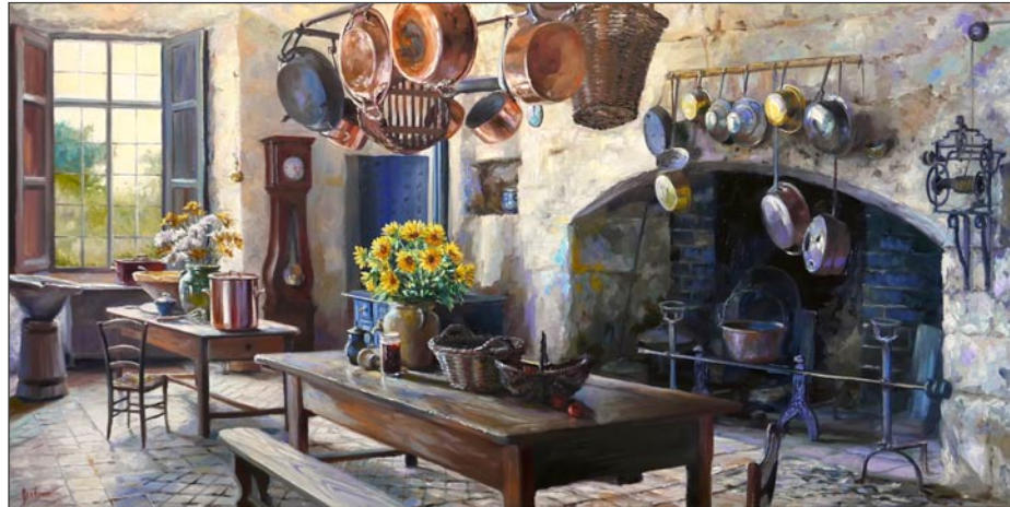
Wildflowers in the Castle Kitchen, Chateau Bridoire o/c 18"x 36"