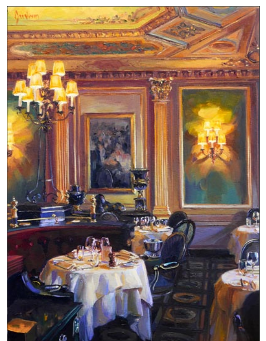
A Parisian Lunch, Laduree o/c 12"x 9"

58 Broad Street Charleston, South Carolina 29401 843.722.3660