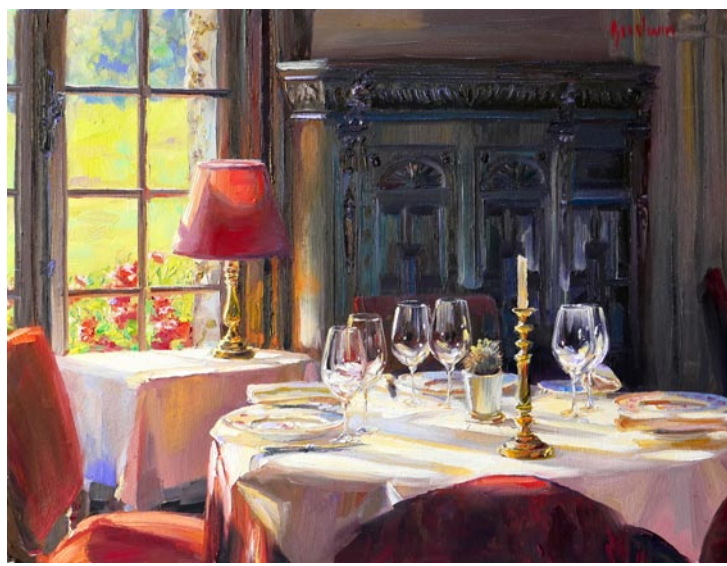
The Meadow View, Abbaye des Vaux o/c 9"x 12"