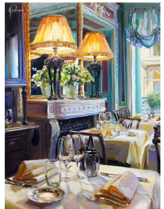
Colors of Cafe de la Paix o/c 12"x 9"