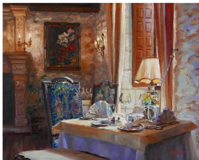
Candlelit Corner of Chateau de la Fleunie o/c 8"x 10"