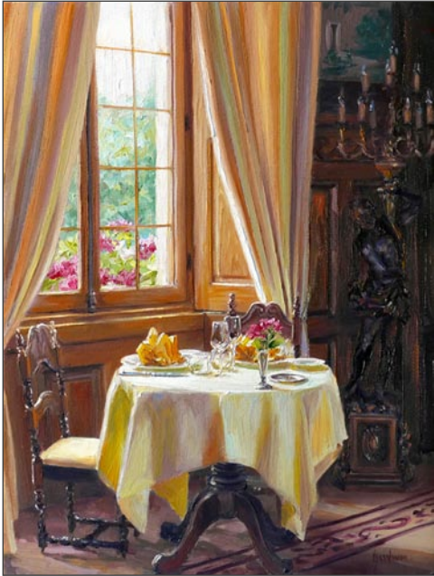
Caryatid Candelabra, Chateau deCurzay o/c 12"x 9"

Reception May 4, 5:00 - 8:00 pm | Exhibition May 4 - 31st, 2018