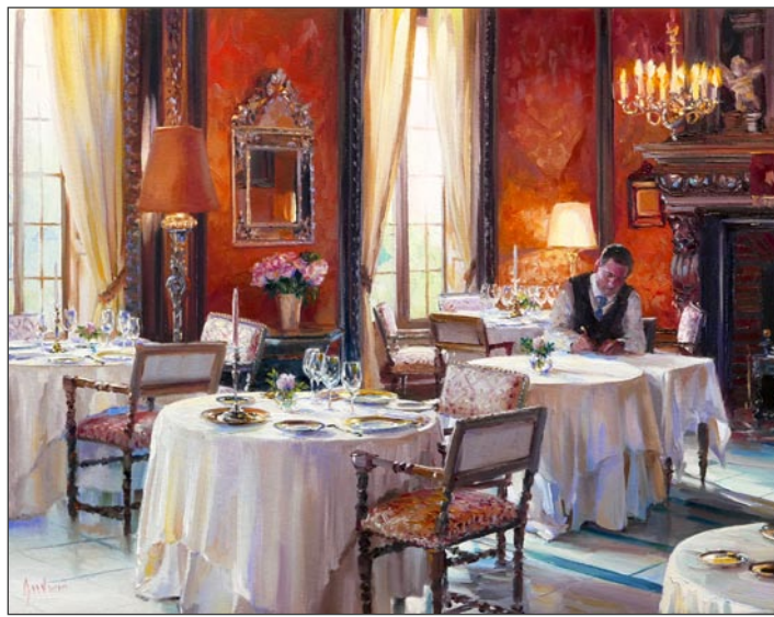
Le Gerant du Restaurant, Chateau de la Treyne o/c 11"x 14"