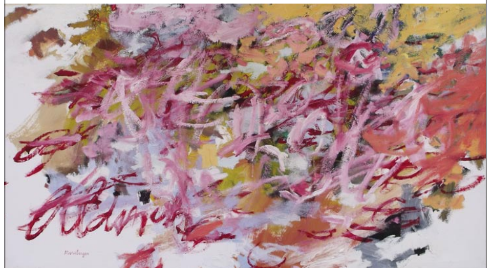
Undulations , 1996-2001