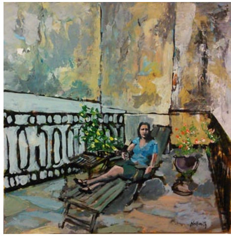
Work by Bruce Nellsmith

"Drawing and painting on location will 'emboss' the experience of being present (in the midst of the subject) on one's memory and in one's soul, but even more draw-