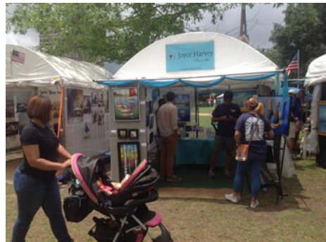
A view of one of the tents at Marion Square Park, favorite pastime.

continued above on next column to the right