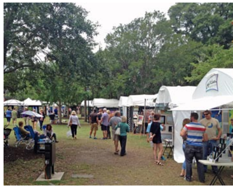
A wide view of many artist's tents in the park.

There are many exciting challenges of having such a long-running outdoor event. Over the years they have experienced flooding, tropical storms, bats, bugs, heat waves, rogue sprinklers, unwanted overnight visitors, fallen trees and more. During the slow times during the week, you'll find artists passing the time with ping pong or bocce ball games. Artists created a fun Red Solo Cup race on the last day where creative homemade costumes have priority over finish times. There are slow times during the 16-day event and practical jokes of fellow artists have become a