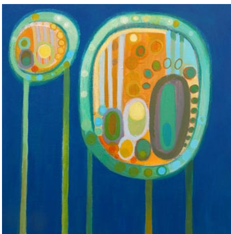
Work by Lisa Shimko

For more 2016 North Charleston Arts Fest information, including event details, site maps, and social media contest rules, visit ( www.NorthCharlestonArtsFest.com ) or contact the North Charleston Cultural Arts Department office at 843/740-5854.