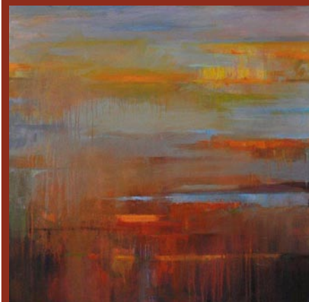
Sunset Filter oil on canvas, 30" x 30"