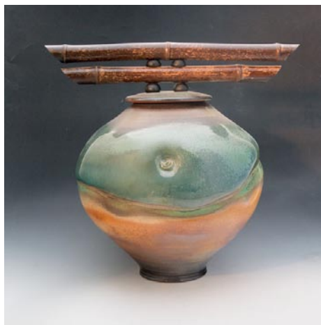
Work from Dalton Pottery

In 2003 the Daltons moved to their current location, where they built a studio before building their home. Jim says they had their priorities in place!