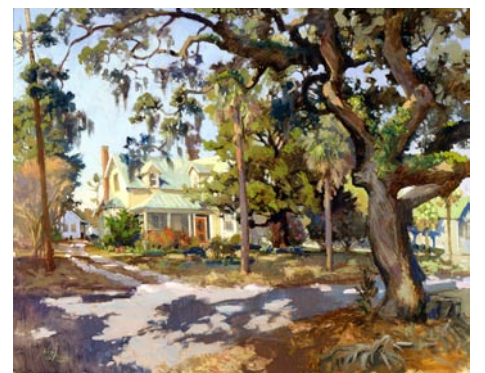
Work by West Fraser

On May 9, at 2:30pm - Curator led tour of People's Choice . Free with museum