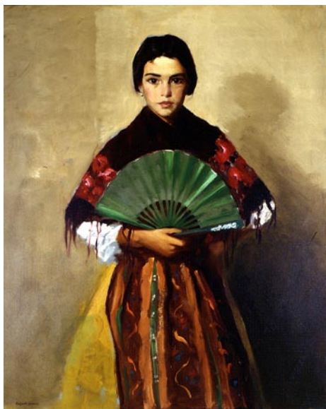
Work by Robert Henri

The Gibbes Museum of Art in Charleston, SC, will present People's Choice: A Community Curated Exhibition , on view from May 3 through Sept. 15, 2013.