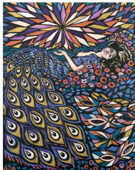
Work by Elana Barna

By Appointment Only Please call (843) 478-2522 www.EvaCarterGallery.com