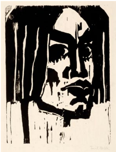
Emil Nolde, German, 1867–1956. Head of a Woman III , 1912, woodcut. Ackland Fund. © Nolde Stiftung Seebüll, Germany.

referential drawing, introduce an anarchic expressivity into the mix.