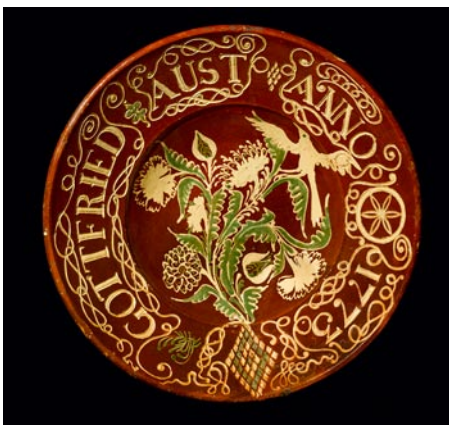
Shop Sign by Gottfried Aust, Salem, NC, 1773. Slip decorated earthenware. Collection of the Wachovia Historical Society, courtesy of Old Salem Museums & Gardens. Photography by Gavin Ashworth.

Art in Clay: Masterworks of North Carolina Earthenware , will travel next to Colonial Williamsburg Foundation (Sept. 26, 2011-June 24, 2012); and Huntsville Museum of Art, Huntsville, AL (Oct. 7, 2012-Jan. 6, 2013).