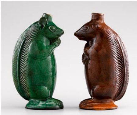
Squirrel Bottles, Salem, NC, 1804-1829, earthenware. (left) Collection of the Wachovia Historical Society, courtesy of Old Salem Museums & Gardens. (right) Collection of Old Salem Museums & Gardens.

Masterfully decorated slipware, sculptural bottles, refined creamware, and faience are but part of the rich artistic legacy of North Carolina's first earthenware potters. During the last half of the eighteenth century, artisans of European descent introduced a variety of old world ceramic traditions to the Carolina backcountry. From both an artistic and technical standpoint, the work of these craftsmen often surpassed that of their Middle Atlantic and New England contemporaries. North Carolina potters transformed the simplest of materials into vessels of practical utility, astonishing beauty, and deep cultural significance. This exhibit is the first major survey of this work and the context in which it was created.