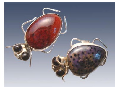
J.L.K. Jewelry at Jugtown

of America's most comprehensive history attractions. Its museums - the Historic Town of Salem and the Museum of Early Southern Decorative Arts (MESDA), along with award-winning heirloom gardens - engage visitors in an educational and memorable historical experience about those who lived and worked in the early South. For more information about the museums' collections and educational programs, please visit ( www.oldsalem.org ).