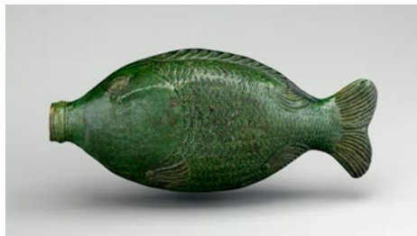
Fish Bottle, Salem, NC, 1801-1829, earthenware. Collection of Old Salem Museums & Gardens.

history and religion worked on the project, creating what is described as "the first major survey of this work and the context in which it was created."