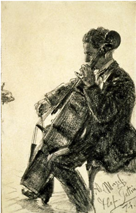
Adolf Menzel, German, 1815–1905. A Cellist at Hofgastein , 1874, graphite. Ackland Fund.