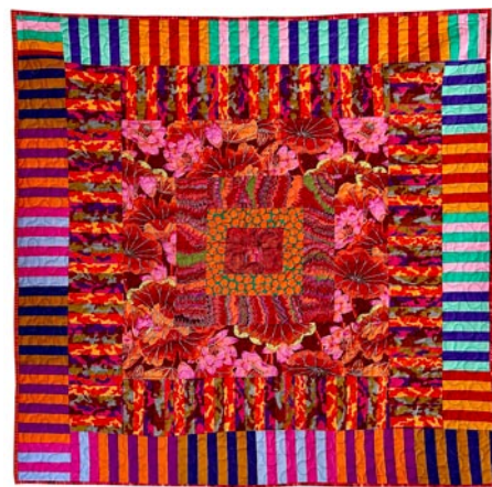
Work by Sandy Teepen of Atlanta, GA

Renewal has many meanings: rebirth, regeneration, rejuvenation, revival, recharge, refresh and many more. The process of renewal is a natural force. We tumble through summer and fall, hibernate in winter, and emerge with new life in spring. Upcycling and mending, and making the old new again result in renewal. As artists, how do we express this? What images, colors or techniques represent the sense of fullness and vigor that renewal brings?