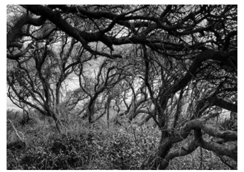
Work by (Joe) P. Wiegmann

Established in 2015, Art in Bloom Gallery is located in Wilmington at Mayfaire Town Center, presents an eclectic mix of original art, and represents over 30 artists. Visitors will find a mixture of traditional, contemporary, and avant garde paintings, sculpture, ceramics, jewelry, glass, mixed media, photography, fabric art, and more by local, regional, and national artists. The gallery is open every day of the week and has something for everyone.