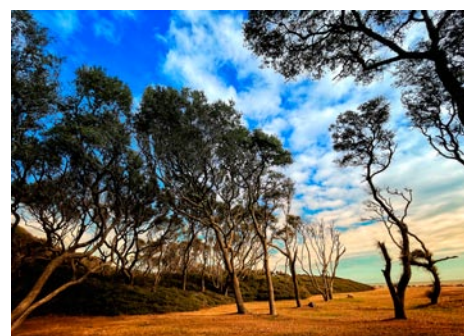
Work by (Joe) P. Wiegmann

“While photography is my current creative medium, I have noticed that my art and graphic background plays heavily with my images. I begin by observing my surroundings before even taking my first photo. I look for lines, shapes, layers, colors, and textures. I consider taking photos from various angles and heights to best capture the image,” adds Wiegmann. “I mainly use a Fujifilm X-T3 camera and occasionally, my iPhone Pro 12 in RAW mode, to be able to employ various lighting effects. I bracket my shots and take full image as well as tightly cropped images, so I have plenty of information going into post-production.