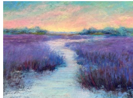
Work by M.P. “Squeaky” Swenson

Drawing inspiration from the upcoming symposium, Apr. 18-19, 2024, on coastal resilience in South Carolina, Living with Water seeks to explore the multifaceted dimensions of existence along the state's coastline. Through a fusion of mediums and perspectives, Miller and Swenson offer a poignant reflection on the maritime heritage inherent in the region's relationship with water.