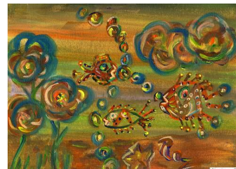
"Blowing Bubbles with the Flowers"