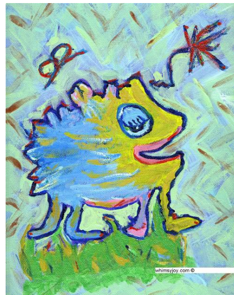
Grog The Frog

"You may think I am Silly; They should name me Billy..."