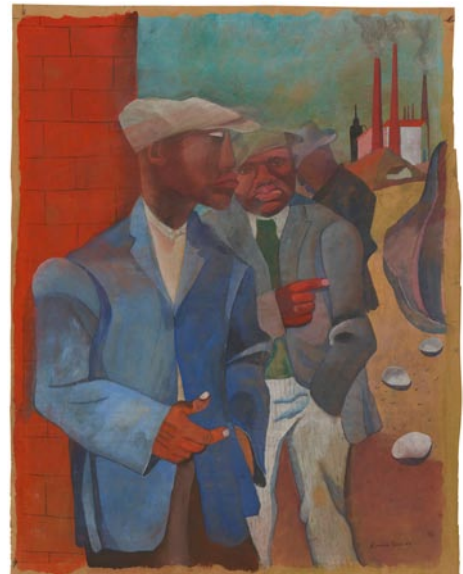
Romare Howard Bearden, "Factory Workers", 1942, gouache and casein on brown kraft paper mounted on board, 37" x 33 1/2", Minneapolis Institute of Art