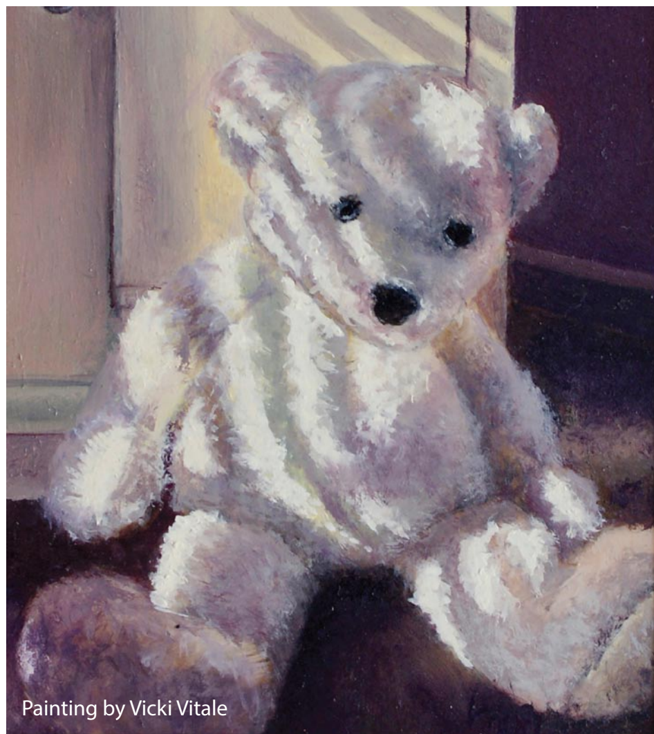
Painting by Vicki Vitale

continued above on next column to the right