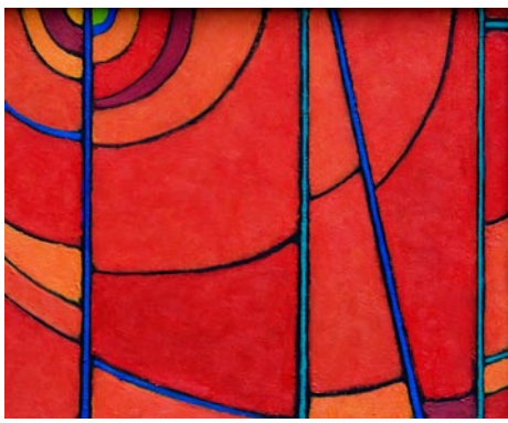
Heat Wave by Ann Hubbard

"I have always been intrigued by surface textures in life and art," adds Hubbard.