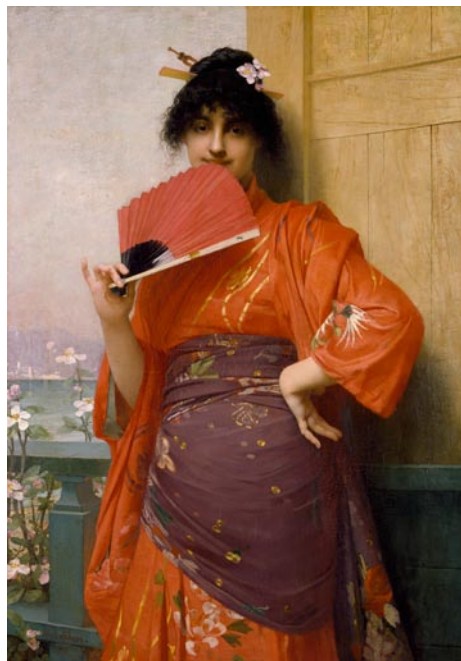
Jules Joseph Lefebvre, Une Japonaise (The Language of the Fan) , 1882, oil on canvas, 51 x 34 1/2 in., Chrysler Museum of Art, Norfolk, Va., Gift of Walter P. Chrysler Jr., 71.2058