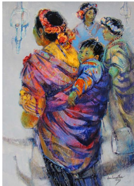
Work by Jan Ledbetter

ALTERNATE ART SPACES - Hendersonville First Citizens Bank Main Street , 539 North Main Street, Hendersonville. Through Apr. 5 - "Artists of Tomorrow," featuring works by area secondary students. Musical and/or theatrical performances by Henderson County students are planned for each of the opening receptions. The exhibits are sponsored by the Arts Council of Henderson County. Hours: Mon.-Thur., 9am-5pm & Fri., 9am-5pm. Contact: 828/693-8504 or at ( http://www.acofhc.org ).