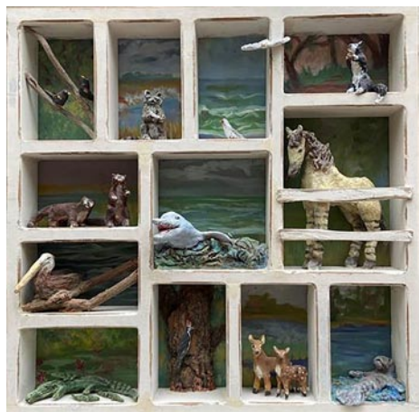
Work by Nancy Mitchell

The show is a celebration of nature, featuring paintings and sculptures depicting land animals and sea life found in the Lowcountry and beyond. Mitchell's impressionistic animal forms and paintings in soft, muted tones contrast beautifully with Parker's boldly colored sculptures, often made from found objects and finished with whimsical details.