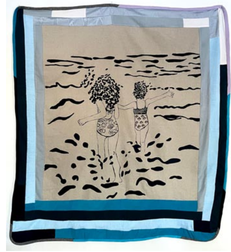
Work by Rachel GloriaAdams

Cultural Arts Building, ground floor, corner of Randall Parkway and Reynolds Drive, UNC-Wilmington, Wilmington. CAB Art Gallery, Through Mar. 26 - "Rachel Gloria Adams: Bloom for Yesterday." The exhibition is a collection of 10 quilts that highlight moments of tenderness within the Adams family. A combination of paint and quilting are patched together to capture these seemingly small moments that reflect the happiness, pride and depth of motherhood. These moments are depicted in an illustrative style that distills the essence of its subjects. Subtle clues of the subject's