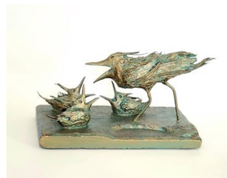
Work by Bob Thames

Sandpiper Gallery , 2201 Middle Street, across the street from Poe's Restaurant and beside Station 22 Restaurant, Sullivan's Island. Ongoing - Minutes from Charleston on charming Sullivan's Island, the gallery features a fresh mix of breath-taking paintings, pottery, exquisite jewelry and unique works in wood, glass and metal. The eclectic collection of works in this gallery is sure to bring a smile and will interest both the seasoned fine art collector as well as the fine craft enthusiast; from stunning paintings to special gifts from the lowcountry. Hours: Mon.-Sat., 11am-6pm. Contact: 843/883-0200 or at ( www.sandpipergallery.net ).