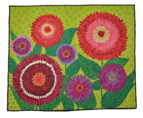
Work by Jude Stuecker

In addition to the live demonstrations, a curated selection of antique and vintage quilts from Brown's collection will be displayed. Brown will host informal talks at 11am and 1pm each day, offering a closer look at the quilts and inviting visitors to ask questions about their history. These discussions will cover key aspects of quilt dating, including fabric types, patterns, and historical context - providing a unique opportunity to connect with the rich traditions of quilting.