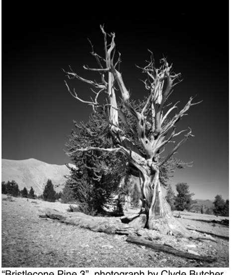
"Bristlecone Pine 3", photograph by Clyde Butcher

of the American landscape, spanning beautiful sites across the United States. Butcher's views include some of the same locations shot by the photographer Ansel Adams, demonstrating the unique light and clarity that his artistic vision brings to those scenes.