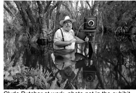
Clyde Butcher at work, photo not in the exhibit America the Beautiful includes 43 large-scale, black and white photographs

Butcher's images of these treasured landscapes, including the Great Smoky Mountains, document the changing environment, capturing what is there today and encouraging us to enjoy the beauty of nature. His images speak for countless diverse places of wilderness and respite found throughout all of America, allowing us an appreciation of our land.