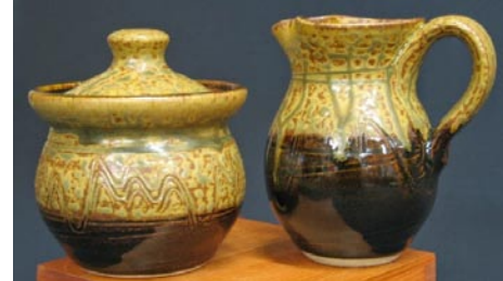
Works from Whynot Pottery

White Hill Gallery , 407 Highway (15-501), Carthage. Ongoing - Featuring works of beautiful pottery, including Southwest, ceramic, hand-painted glassware, wood turning, and paintings in watercolor, oil and pencil. Hours: Tue.-Fri., 10am-6pm; Sat., 10am-5pm; & Sun., 1-5pm. Contact: 910/947-6100.