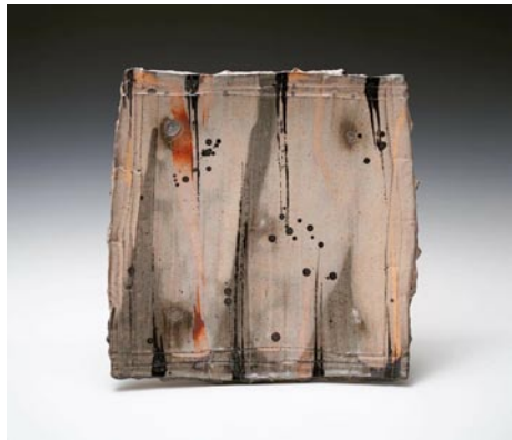
Work by Takuro Shibata

Stuempfle Pottery , 1224 Dover Church Rd., Seagrove. Ongoing - Featuring pottery with expressive shapes and natural surfaces by David Stuempfle. Hours: during kiln openings and by appt. Contact: 910/464-2689 or at ( www.stuempflepottery.com ).