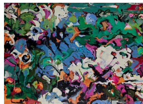
Work by Sheila Grabarsky

For further information check our SC Institutional Gallery listings, call the Center at 803/641-9094 or visit ( www.aikencentre-