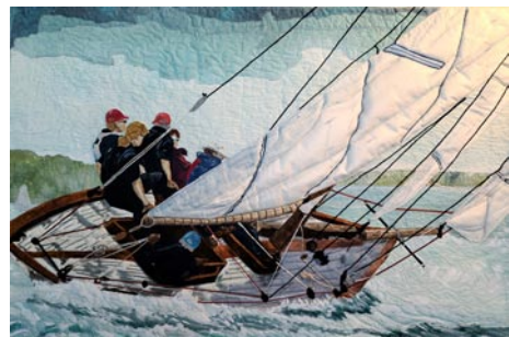
Work by Peg Weschke

For further information check our SC Institutional Gallery listings, call the League at 843/681-5060 or visit ( www.artleaguehhi.org ).