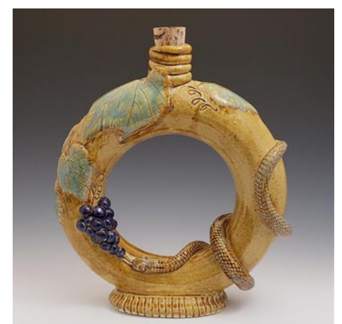
Work by Maggie Jones of Turtle Island Pottery

Saturday's festival, which begins at 9am and continues through 5pm, also includes pottery videos, live demonstrations, and a special lecture and exhibit. The lecture is at