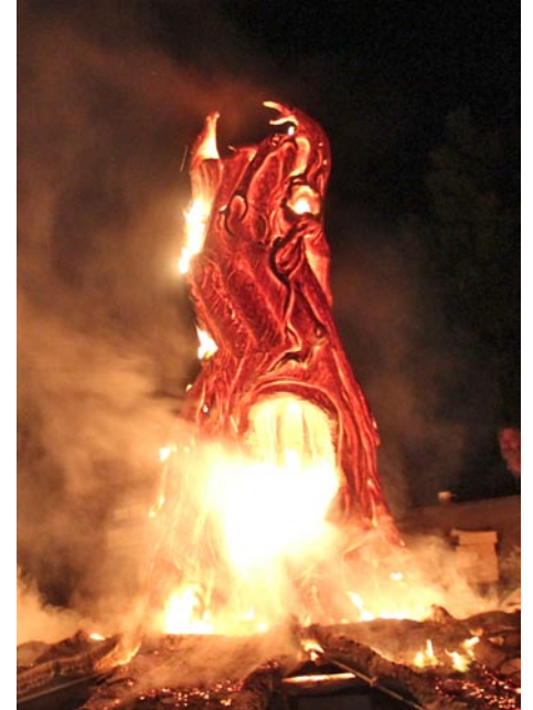
The Fire Tree sculpture was designed by ceramic artist Carol Gentithes, fired during 2015 FireFest and unveiled during Saturday's finale event. Sergei Isupov will create the 2016 fire sculpture.

Featured artists with works in the exhibit