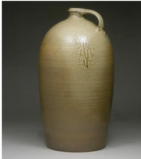
Work by Chad Brown

Celebration of Spring will continue their popular promotion with the opportunity to win a gift certificate for $150 that