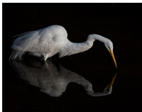
Work by Edith Wood

The SOBA photographers include both shutterbugs and professionals alike and are some of the best in the region. They are visual journalists, recording the beauty, and sometimes the unexpected, of our surroundings. They use their skills to show us new ways of seeing the world and create lasting impressions through their