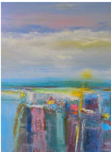
East End 24" x 14" O/C