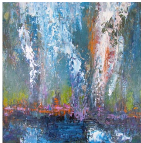
Dulcet I 14" x 14" O/C