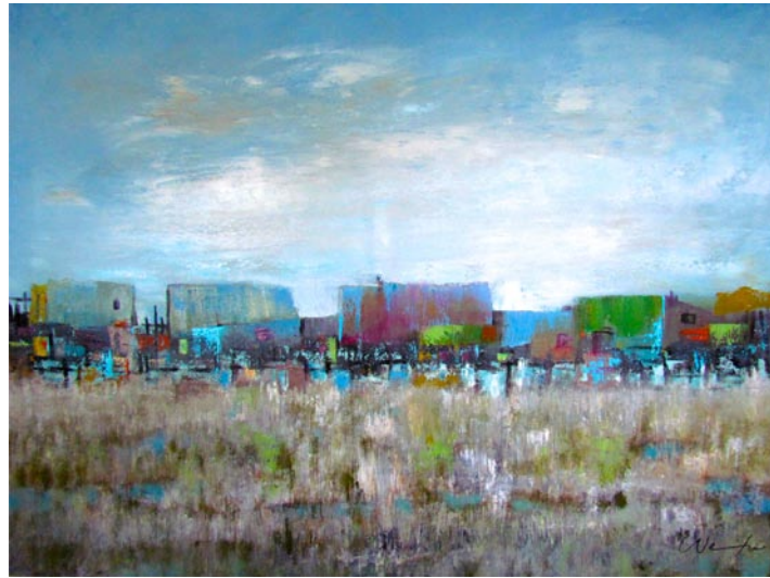
Cojimar 36" x 48" O/C