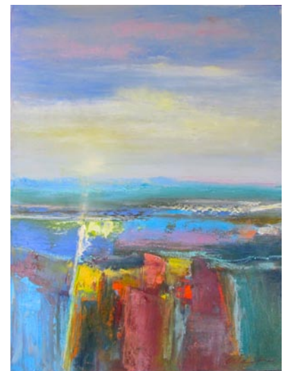
West End 24" x 14" O/C