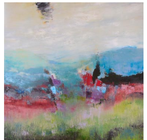
Brink 40" x 40" O/C