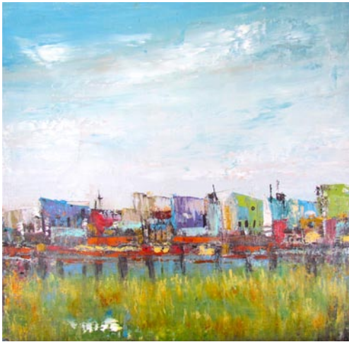
Roost 16" x 16" O/C