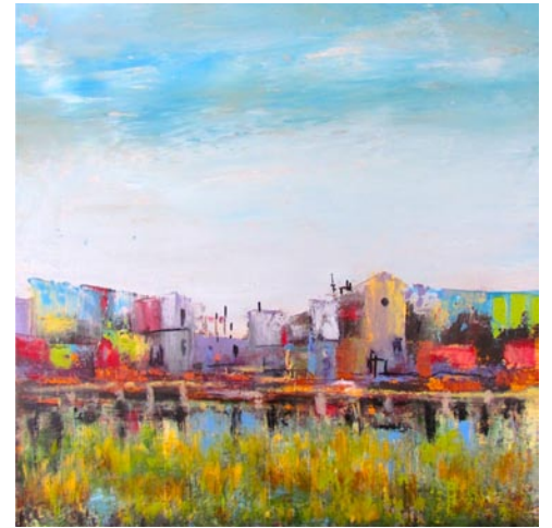
Roost-ers 16" x 16" O/C