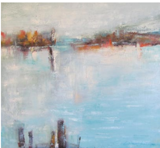
Out to Sea 30" x 30" O/C