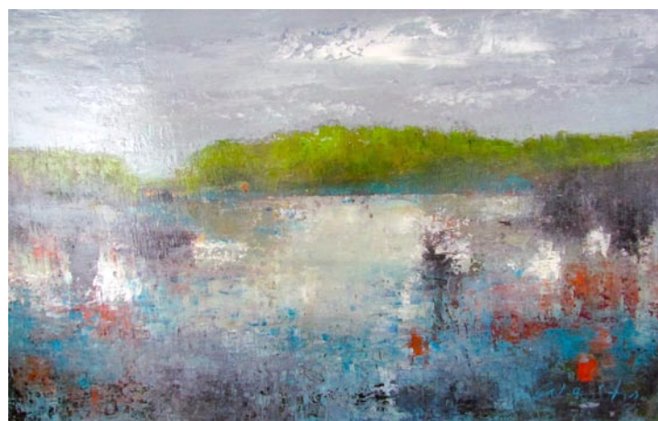
Clouds Over the Horizon 24" x 37" O/C