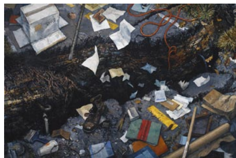
Work by Chester Arnold at Brookgreen Gardens

Asheville Art Museum, Asheville, NC. For further information call the Museum at 910/395-5999 or visit ( www.cameronartmuseum.org ).