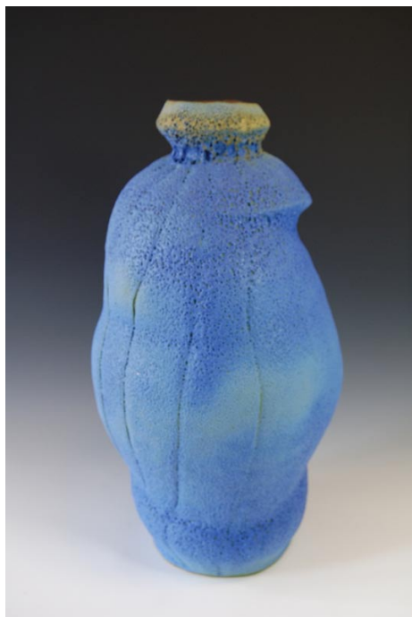
Work by Hiroshi Sueyoshi

Asheville Art Museum, Asheville, NC. For further information call the Museum at 910/395-5999 or visit ( www.cameronartmuseum.org ).