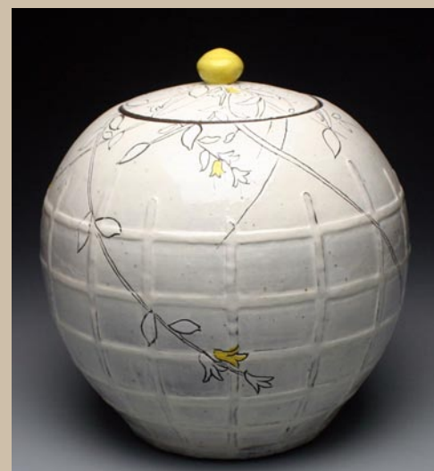
Work by Ben Carter

If you like what you hear you might want to sign up for the newsletter. To join the list click the following link and sign up in the box below the streaming player: ( http://www.carterpottery.blogspot.com/2009/05/welcome-to-tales-of-red-clay-rambler.html ).