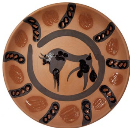
Bull by Pablo Picasso, 1957, © 2014 Estate of Pablo Picasso / Artists Rights Society (ARS), New York

"Picasso is an artist that most people recognize, and have strong opinions about, and this is the type of show that people will travel to see," said Gallery Director Silvana Foti. "A Picasso show is something that we