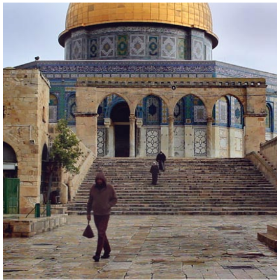
Ann Pegelow Kaplan PHOTOGRAPHY