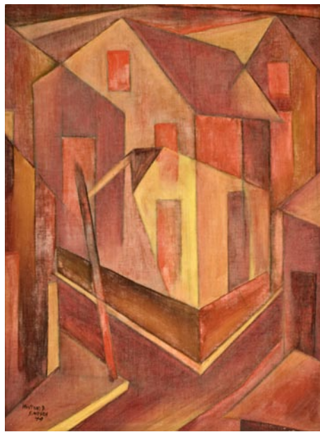
Untitled , by Merton Simpson, oil on canvas in 1949. Courtesy of the Gibbes Museum of Art. Photo courtesy SC State Museum

"The exhibit includes many large scale works of art on canvas, as well as mixed media work that pushed the boundaries, and our perceptions, of how abstract art is perceived," said the curator. "Museum guests will be surprised and inspired by the work of these important artists."