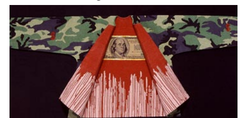
Work by Jon Eric Riis

The art of tapestry weaving was practiced by ancient peoples from Egypt to Peru. Tapestry weaving emerged in Europe as an important art form in the Middle Ages, when large tapestries served practical and aesthetic functions such as insulating hangings and moveable interior decorations. In Asia, tapestries were generally used for smaller accessories, functional objects and fine apparel. Riis' work has been influenced by Russian ecclesiastical textiles, Russian icons and imperial court costumes from the Qing dynasty in China (1644-1911). In 2006 Riis had the opportunity to spend time in Eastern Tibet and many of the works in this exhibition reference this experience.