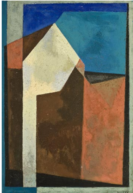
The Structure , by William Halsey, an oil on masonite work from 1949, courtesy of the Gibbes Museum of Art.

The new art exhibit on view at the South Carolina State Museum in Columbia, SC, examines a topic not always quickly associated with the traditions of the Palmetto State – abstract art. The exhibit, Abstract Art in South Carolina: 1949-2012 , on view through Aug. 26, 2012, in the Lipscomb Art Gallery, is the first inclusive look at the evolution and influences of abstract painting and sculpture in South Carolina.