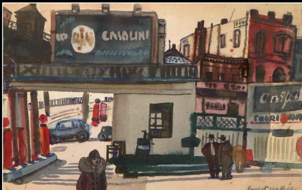
New York Gas Station Ca. 1930 Watercolor by Ernest Walker

Selected paintings from the estate collections of Leon Makielski & Ernest Walker (1885 - 1974) (1892 - 1991)