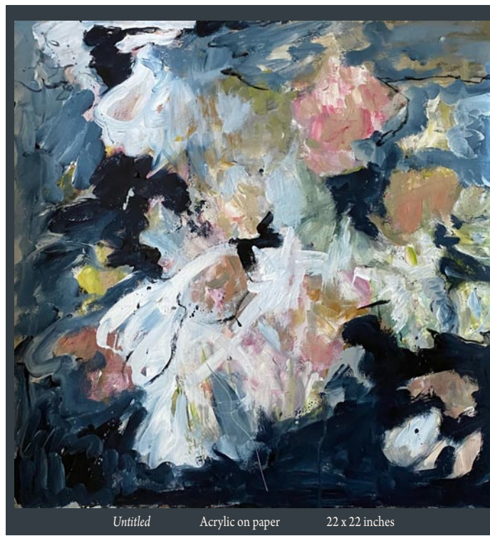
Untitled Acrylic on paper 22 x 22 inches

continued above on next column to the right