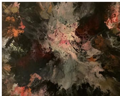
Work by Steve Gregar

“If you are looking to fill an empty space on a wall at home or office, give my work a look and know that if it is appealing to you, a purchase will not only fill an empty space