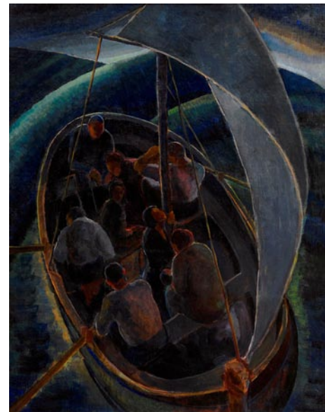
Work by Malvin Gray Johnson

Established in 1926, the Harmon Foundation’s Distinguished Achievement Awards initiative was open exclusively to African Americans working in eight fields of endeavor, such as music, literature, science, and the fine arts. The program became best known for celebrating the work of African American visual artists through nationally touring exhibitions.