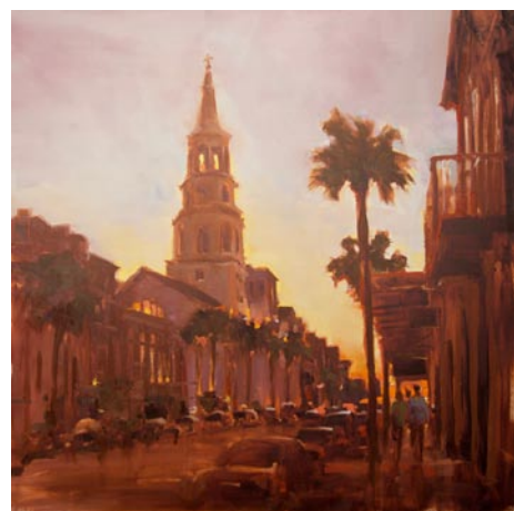
Work by Donald Weber

For further information check our SC Commercial Gallery listings, call the gallery at 843/722-3660 or visit ( www.ellarichardson.com ).