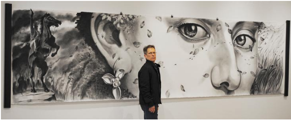
Work by Ben Perini

their visual quality - with detailed rendering, layered symbolism, and hidden imagery that all propels the themes.