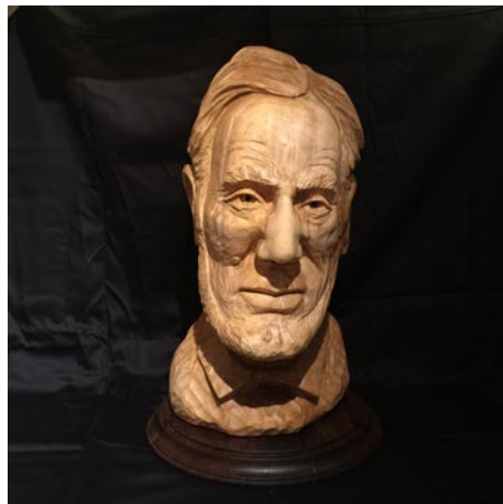
"Abe Lincoln by James Davis, Silver Maple off Leesburg Road Lower Richland County

Crafting Civil (War) Conversations commemorates the 150th anniversary of the end of the Civil War with a juried exhibition of contemporary art. The Museum invited artists from across the Southeast who work in what historically have been regarded as craft-based media - clay, fiber, glass, metal and wood - to imagine the Civil War's end as a scene of reconciliation - not between the North and the South - but between former slaves and former slave owners.