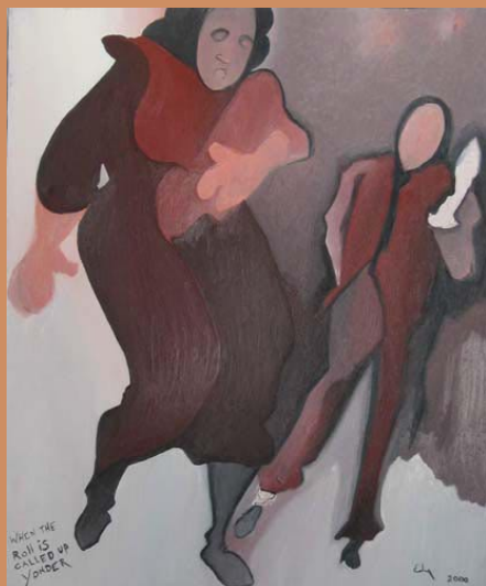
When the Roll is Called Oil on Canvas, 30 x 36 inches