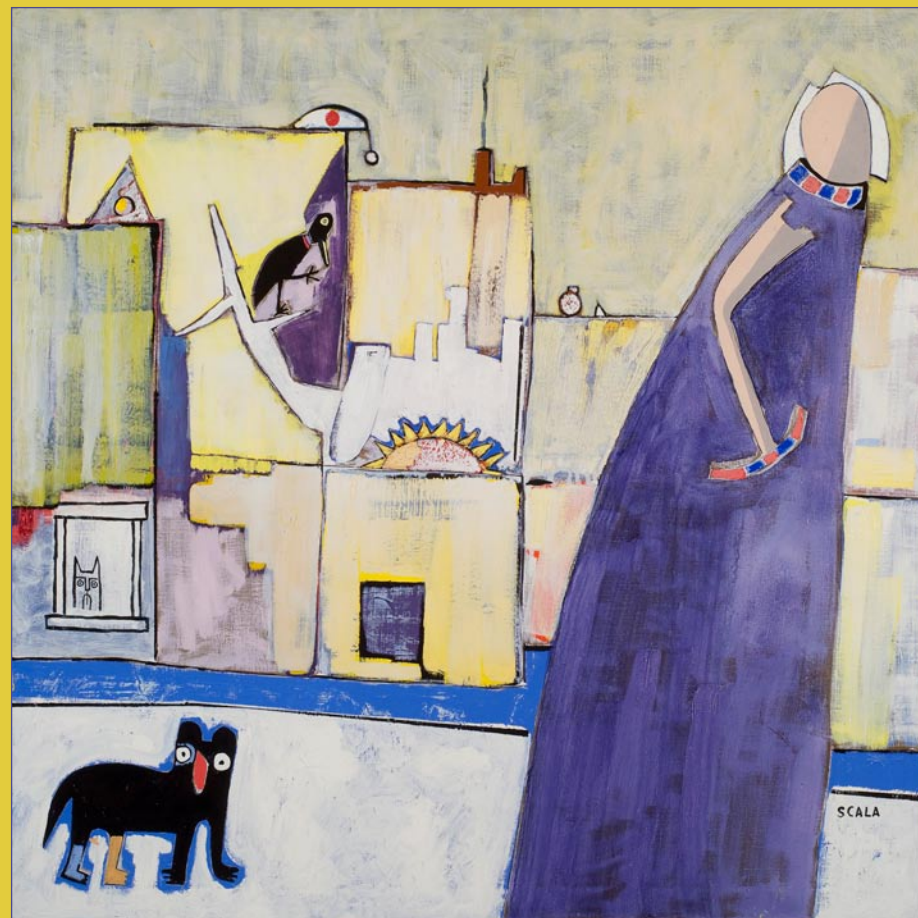
"Trailing" Oil on Linen 36 x 36 inches

Juries Choice: Grand Prize Art Buzz, The 2014 Collection