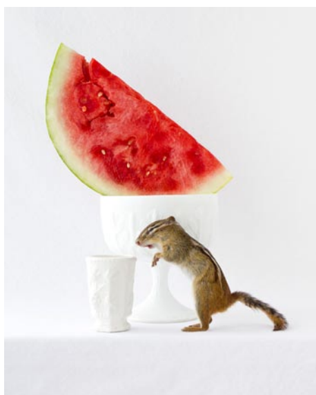
Work by Kimberly Witham

Witham has meticulously documented the ephemera of recently deceased wildlife that she finds near her suburban home in New Jersey, complemented by household items, good design, and an aesthetic that harkens to slick magazine layouts. The images look peaceful or even lusciously beautiful at first, until the viewer begins to look closer at the creatures that inhabit the image, a moment in time captured and