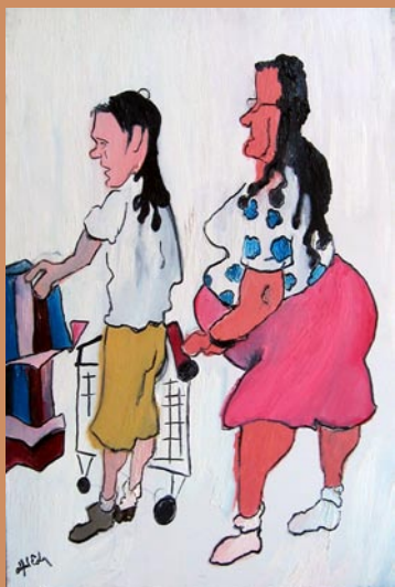
Mother and Daughter Shopping Oil on Canvas, 24 x 36 inches