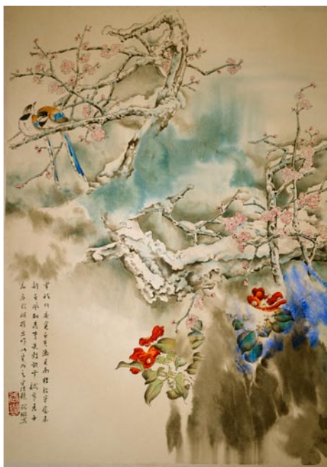
Work by Viven WuShaun Burns

ing photographs from the local Alamance area. All of the images presented were captured digitally with Canon professional cameras and lenses. They have been subjected to minimal digital manipulation, most of which is intended to reproduce classic darkroom techniques. They are printed on 100-year archival Kodak photographic paper using the traditional silver halide photographic process, which gives them a luminosity and longevity not to be found with inkjet reproduction.