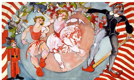
Work by Zelda Sayre Fitzgerald