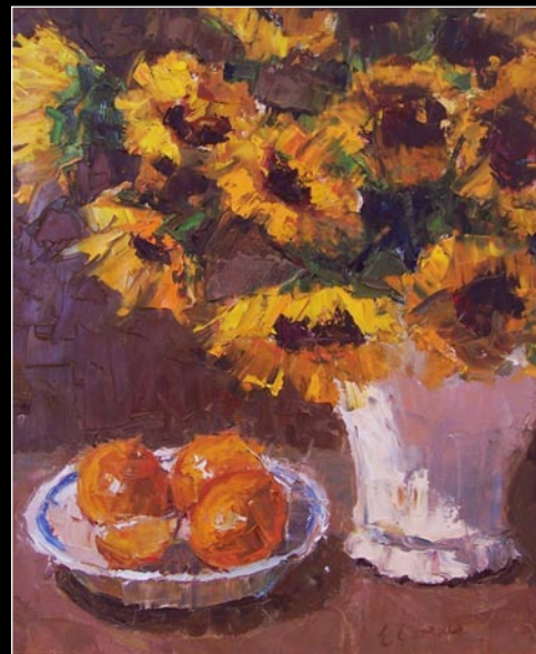
Sunny Flowers by Eileen Corse