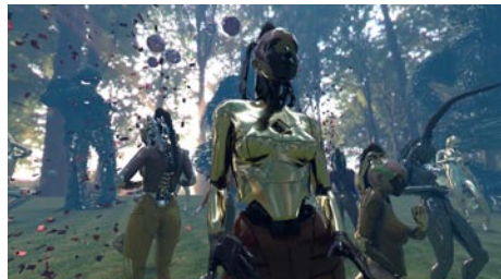
Work by Jacolby Satterwhite

Cornelius Arts Center Gallery , 19725 Oak Street, Cornelius. Ongoing - The Arts Center Gallery is under the direction of the future Cain Center for the Arts. Hours: Mon.-Fri., 10am-4pm. Contact: 704/896-8823, 980/689-3101 or visit ( https://cainarts.org/ ).