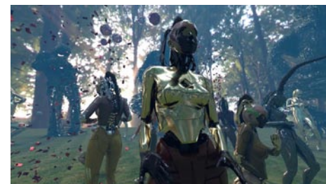
Jacolby Satterwhite, "We Are In Hell When We Hurt Each Other (still)", 2020, HD color video and 3D animation with sound, RT: 24:22 min.

Finding Home Again focuses on Satterwhite's digital animated series, Birds in Paradise , which features a mythological, queer universe inspired by pop culture, African folklore, ritual, video games, and