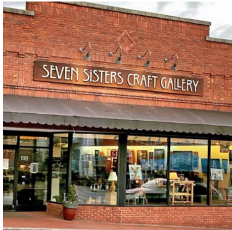
A view outside Seven Sisters Craft Gallery

Mountain Nest Gallery , 133 Cherry Street, Black Mountain. Ongoing - We are a gallery of regional art and craft located in Black Mountain, featuring over 100 artists who live and work in the area. Our collection includes: original oil, acrylic, and watercolor paintings; fine art prints on both paper and canvas; handmade jewelry in silver, gold, and other fine metals; blown glass vessels and jewelry; beautiful and functional pottery; and even more work in other mediums such as wooden bowls, bark baskets, corn shuck dolls, and steel metal sculptures. Hours: Mon.-Sat., 10am-6pm & Sun., 11am-5pm. Contact: 828/669-0314 or at ( https://mynnest.com/ ).