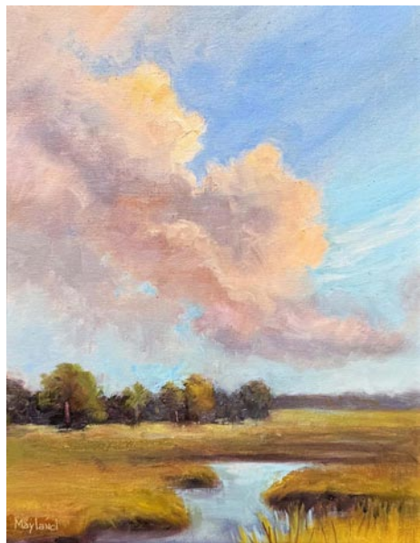
Work by Tina Mayland

The Sportsman's Gallery , 165 King Street, Charleston. Ongoing - Featuring one of the largest, most diverse collections of contemporary sporting and wildlife art found today and once having viewed it, we are confident you will concur. Hours: Mon.-Fri., 10:30am-5:30pm, Sat., 11am-5pm or by appt. Contact: 843/727-1224 or at ( www.sportsmansgallery.com ).