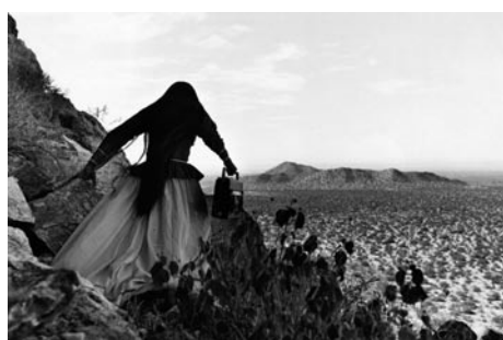
Maya Goded (Mexican, 1967-). From the series "Healing: Body and Land" ( Sanación: cuerpo y tierra ), Los Altos Chiapas, 2019, digital print. The Mint Museum, museum purchase made possible with funds from Allen Blevins & Armando Aispuro and Betsy Rosen & Liam Stokes.

Women of Land and Smoke: Photographs by Graciela Iturbide and Maya Goded (Las Mujeres de Tierra y Humo: Las Fotografías de Graciela Iturbide y Maya Goded) , includes over 50 photographs that present an overview of Iturbide's and Goded's careers that span the Americas.