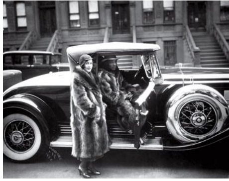
"Couple," is from the exhibition "Follow the North Star." Credit: James Van Der Zee, 1932, silver gelatin print. James Van Der Zee's interest in the everyday lifestyle of his people resulted in this portrait of a couple he happened to encounter one afternoon in Harlem.

through a $1 million gift from the Michelin Foundation. As one of the museum's founding donors, Michelin has been a leader in philanthropic investment to launch and support the International African American Museum, including as the presenting sponsor of Follow the North Star , IAAM's first travelling exhibition.