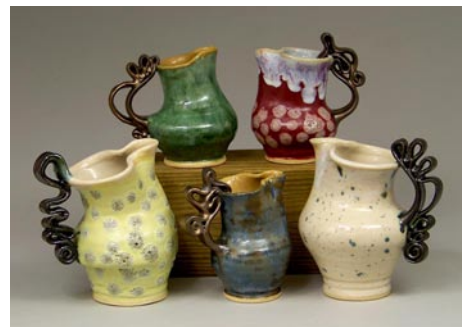
Works from Turtle Island Pottery

Turtle Island Pottery , 2782 Bat Cave Road, Old Fort. Ongoing - Featuring handmade pottery by Maggie and Freeman Jones, who create one of a kind, functional, decorative stoneware items. From cups to umbrella stands, mirror frames and clocks. Sculptural and inspired by nature, many forms are reminiscent of antique pottery from the arts and crafts movement and art nouveau styles. Hours: Showroom open most Saturdays, call ahead for any day of the week. Contact: 828/669-2713 or at (www.turtleislandpottery.com).