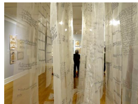
View of installation by Susan Lenz

Last Words features a selection of Lenz's grave rubbing art quilts and framed photo transfers of cemetery angels. Vintage household linens, recycled materials, and artificial cemetery flowers figure prominently. This body of artwork reflects both personal and universal mortality. The exhibit is an exploration of lives' final words. It investigates the concept of remembrance and personal legacy. "As an installation, questions are posed," says Lenz. "The work asks: What are your final wishes? How do you want to be remembered? What last words will mark your